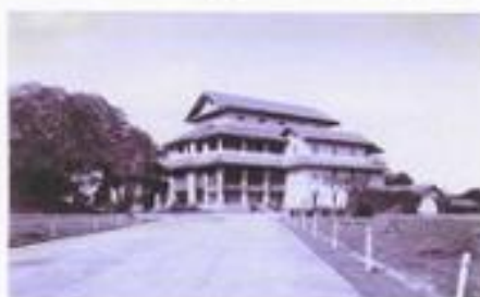
Secunderabad Club. First opened in 1878 for British Officers and Diplomats.