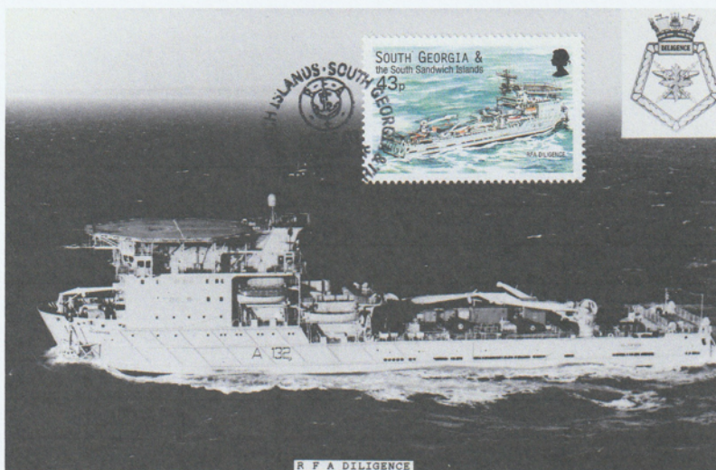
Official postcard of "RFA Diligence" with 43p ship stamp cancelled:- First day of issue 28.05.01. South Georgia & The South Sandwich Islands.