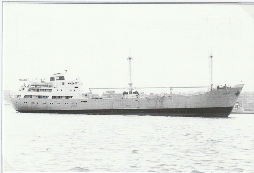
M/S "A.E.S." 994tons on arrival at Tritan da Cunha bringing a gift of 150 sheep from the Falkland Islands on April 7 1964