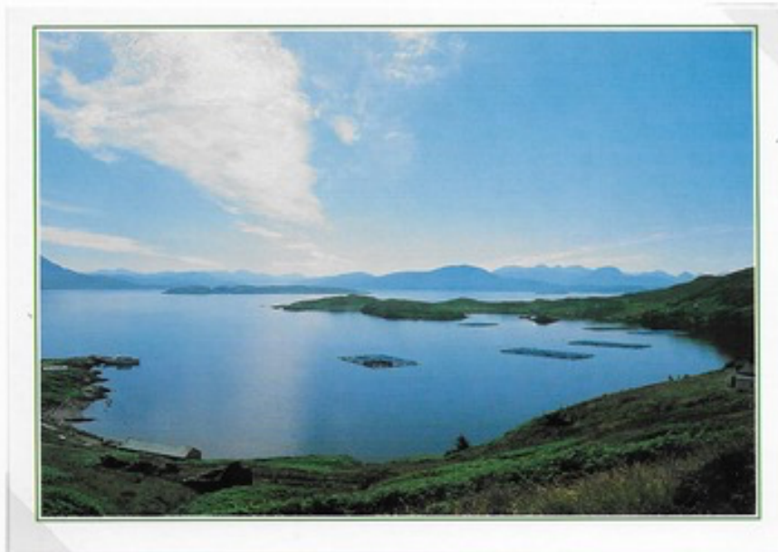
Fish Pens on Tanera More.

Issued 5th July 1985, printed by House Of Questa and designed by Brian Hargreaves. This issue shows some of the modern fish farm practices that can be seen on the islands. The fish are hatched in the islands own hatchery in Loch Kemp and then air lifted in the spring to a deep water pens in Tanera More. The fish are kept for about two years by this time their weight will have increased to about 15lbs. A salmon can weigh up to 40lbs after 4 years at sea.