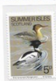
Red Breasted Merganser